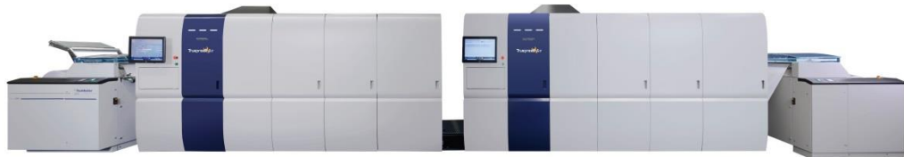
Figure 1: Screen Truepress Jet520HD

As part of its Truepress Jet520HD system, Screen has developed a means of printing on commodity coated stocks without the use of pre-coatings or inkjet-treated papers. This is possible through a combination of new inks, patented screening methods, droplet shape and size control, and new dryer technology that leverage the 1,200 dot per inch inkjet heads of the Truepress Jet520HD. Printing on the same types of coated stocks used on offset printing presses has not typically been possible with water-based (aqueous) inkjet methods. Screen's development has important implications for the production digital print market, since applications that have not been feasible for economic or technological reasons will now be within reach of high-speed inkjet systems. In this sponsored white paper, InfoTrends explores how Screen is addressing this developing market opportunity for Truepress Jet520HD users.